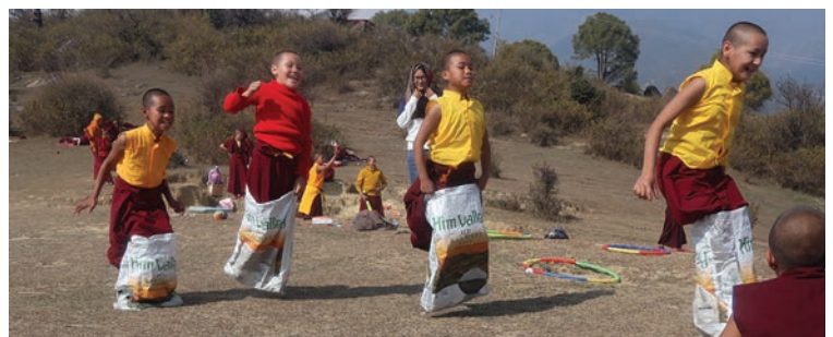
Old fashioned free fun, the classic potato sack race