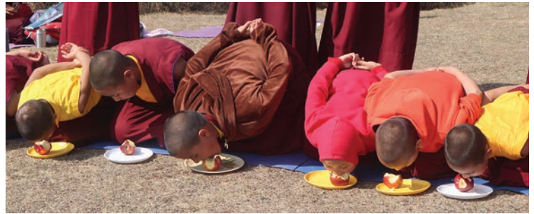
Who can eat the apple first look no hands!