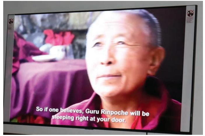
Clip from the film "So if one believes, Guru Rinpoche will be sleeping right at your door."