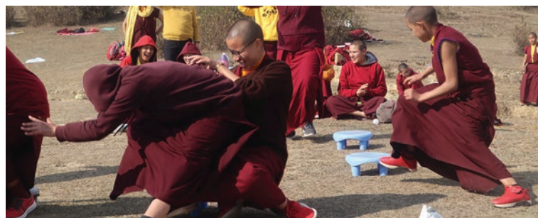
Musical stools with Hindi background music!