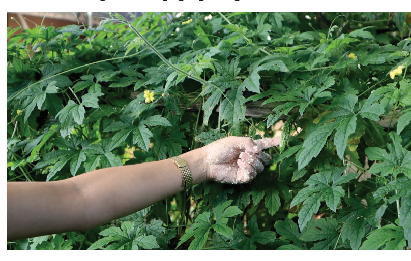
Karela, or bitter gourd, growing on the trellis.