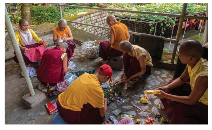
Go team! Washing and cleaning the plastic first is very important.