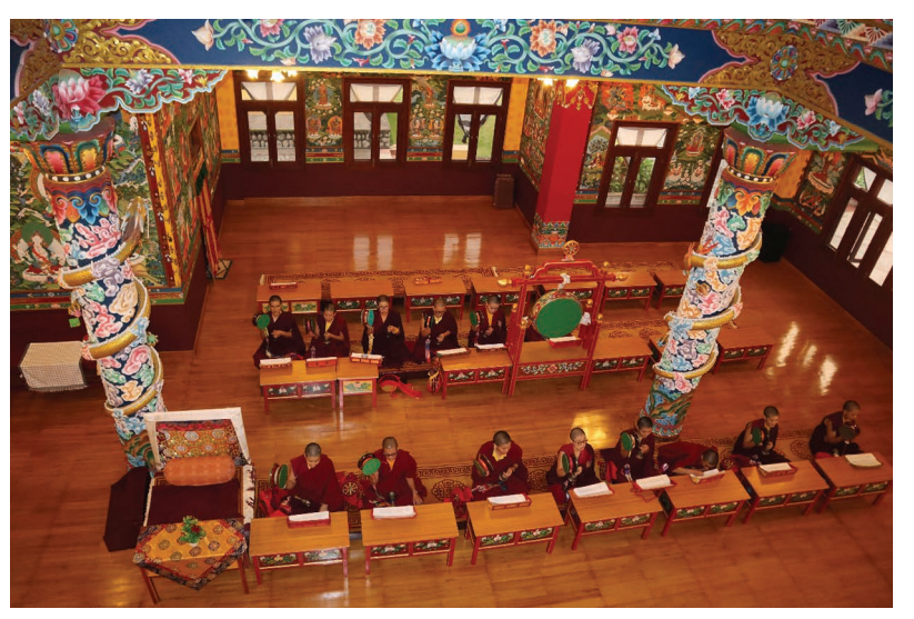
Tsunmas carry on daily prayers continually for the benefit of all beings.

depression, panic, fear and for all the beings we always pray to the Buddhas and we dedicate our prayers daily and we are still dedicating our prayers to all sentient While beings. tsunmas are dedicating our prayers we really feel unbelievable joy and happiness. When we live our day and life for the benefit of others, the doors of depression, fear, anxiety all such things are closed, and instead there is incredible joy and happiness.