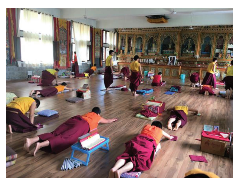
Prostration retreat: tsunmas completing over 100,000 prostrations