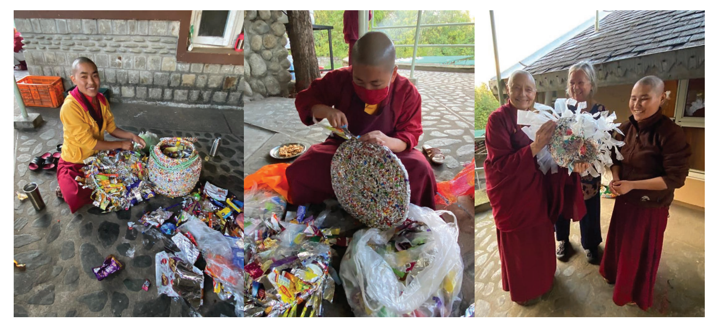
Left: An example of the basket woven entirely out of recycled plastic. Center: Working on a popular mat sold at DGL's Dragon Cafe. Right: Jetsunma is very happy with and impressed by the creativity of DGL's recycling team.