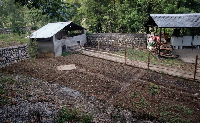
Genesis of the tsunmas gardens.