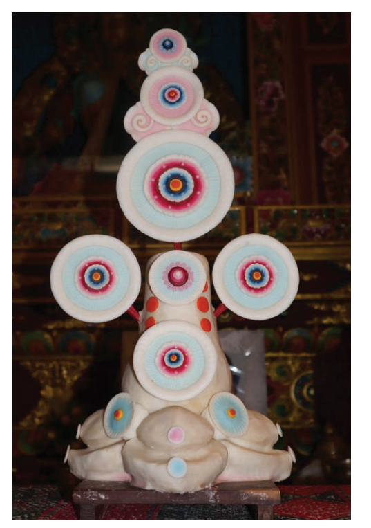
Torma in front of Phagma Drolma (Tara) in the main Temple

The practise of good motivation is very essential for cultivating a good heart and avoiding any evil actions associated with a sense of attachment.