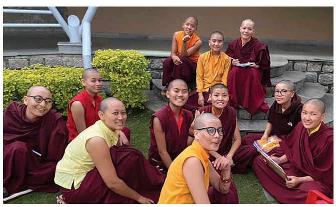
Written collectively by the DGL Recycling Team

We are able to keep our environment clean, improve our health by not breathing the burning plastic smoke and make good use of our waste, too. We also raise some funds for the nunnery by selling the items in our Dragon Café.