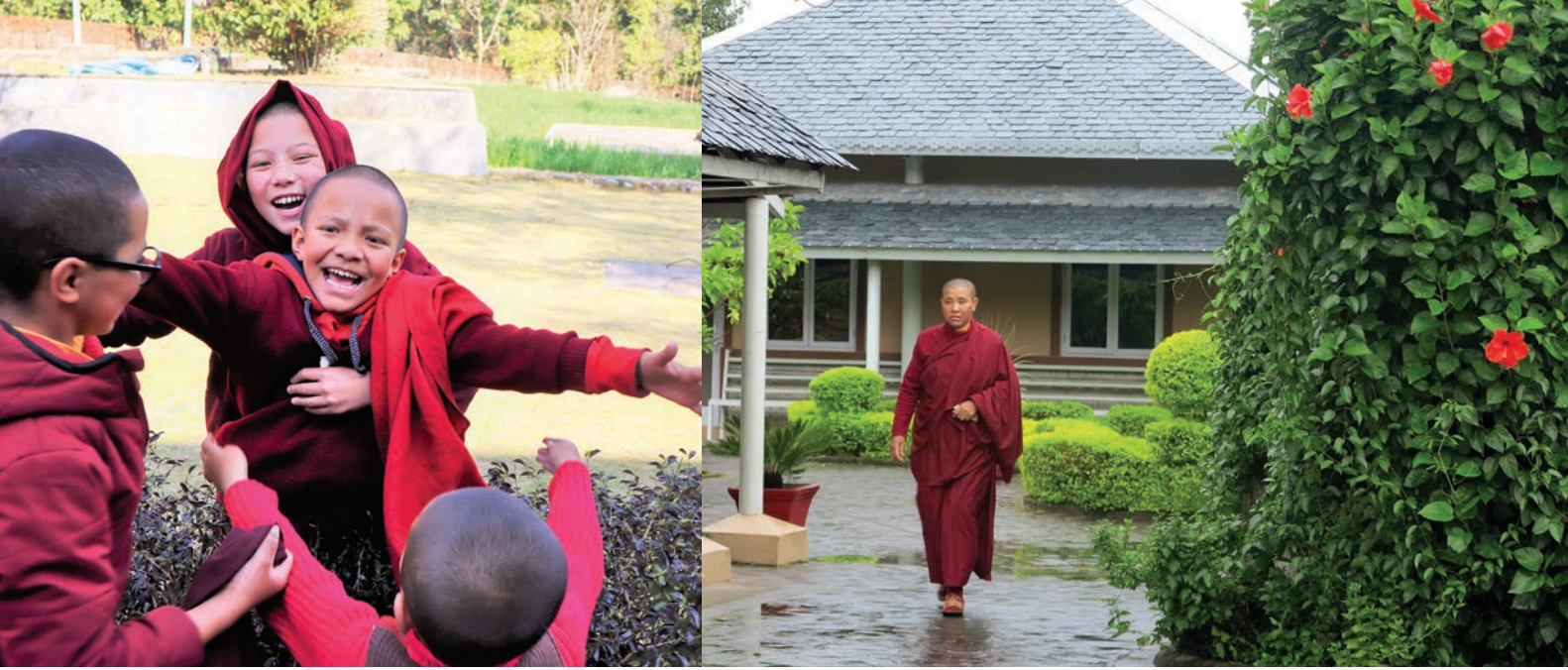
Happy to see you