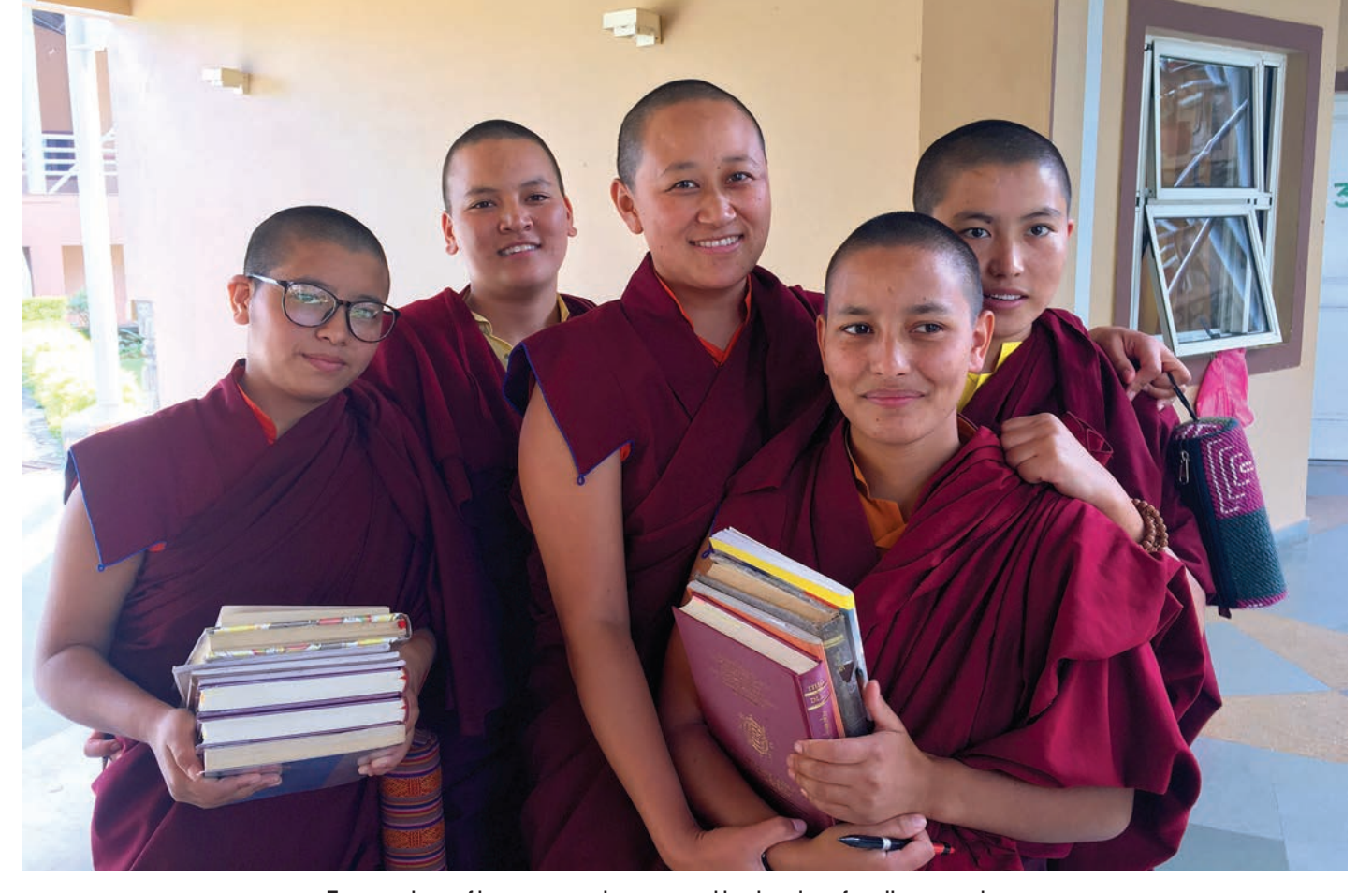
Tsunmas love of learning is only surpassed by their love for all sentient beings