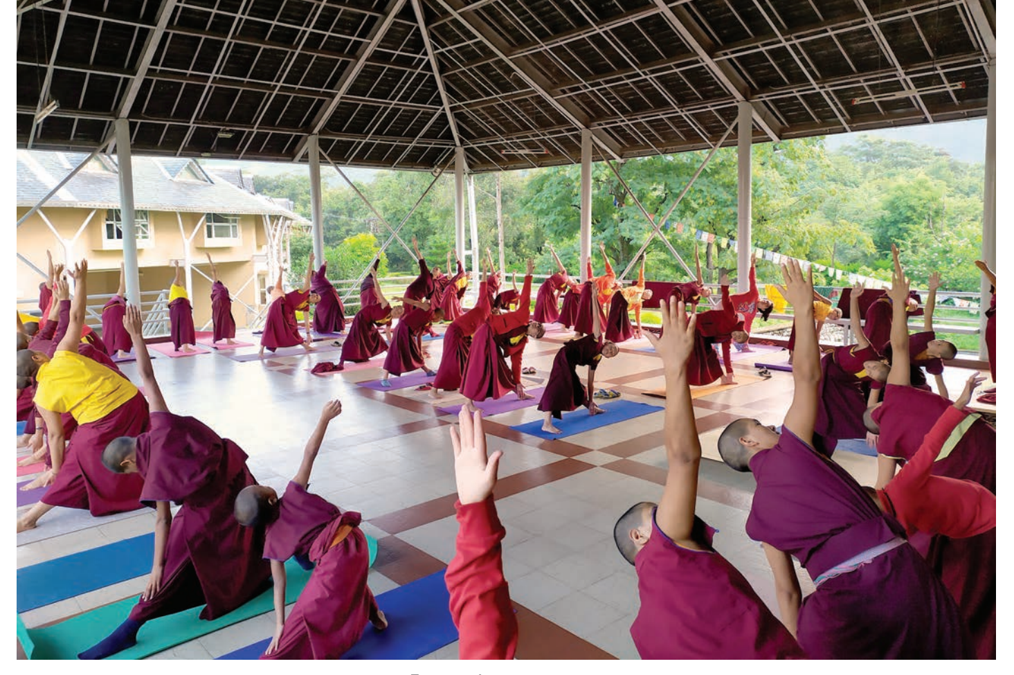
Tsunmas doing morning yoga