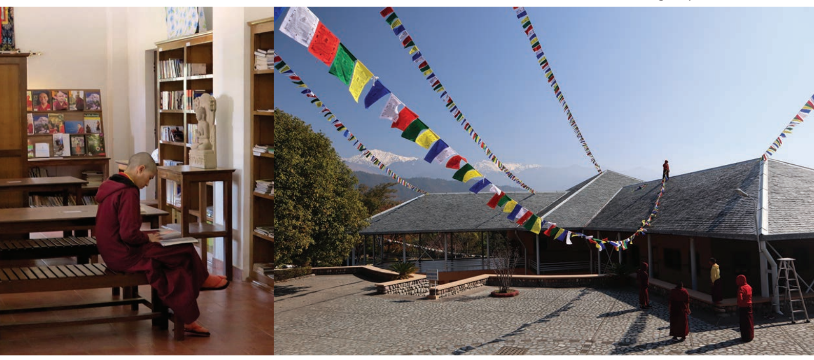
Quiet study DGL library