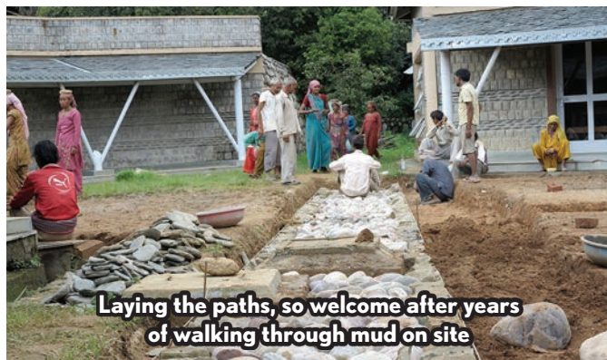
Laying the paths, so welcome after years of walking through mud on site