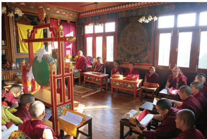
Puja to consecrate our Protector Room