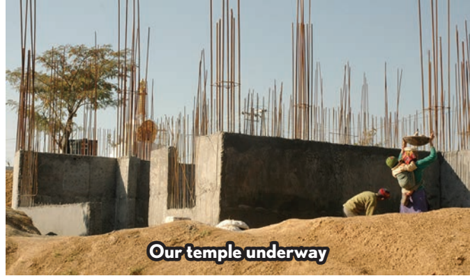
Our temple underway