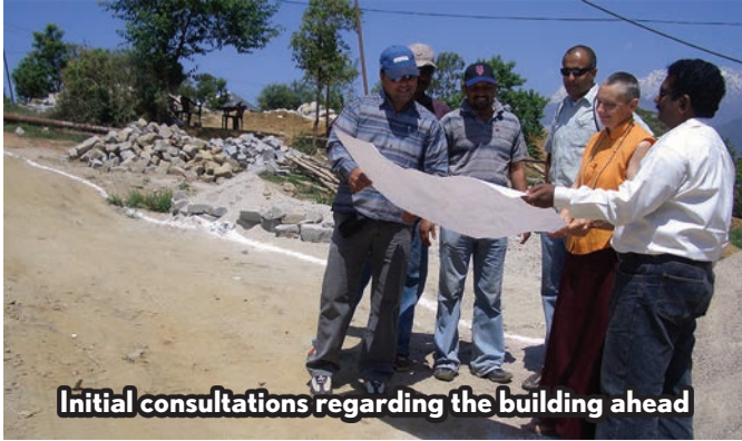
Initial consultations regarding the building ahead