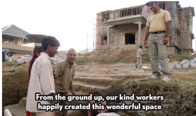
From the ground up, our kind workers happily created this wonderful space