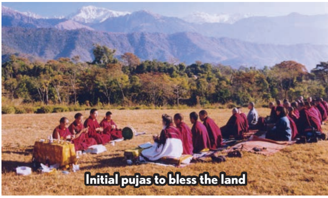
Initial pujas to bless the land