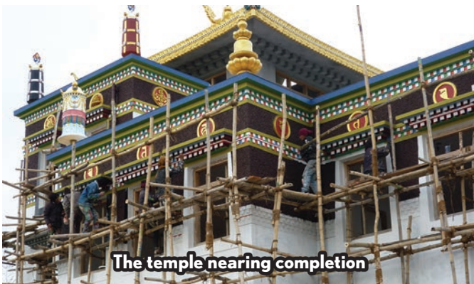
The temple nearing completion