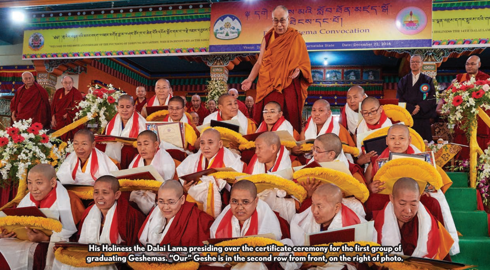
His Holiness the Dalai Lama presiding over the certificate ceremony for the first group of graduating Geshemas. "Our" Geshe is in the second row from front, on the right of photo.

Nagpur in Maharashtra to attend the celebrations for the 60 th anniversary of the conversion to Buddhism by the great legislator Dr Bhimrao Ambedkar who was one of main architects of the Indian Constitution. Born as an 'Untouchable' he nonetheless struggled to become educated and eventually earned 3 doctorates from prestigious foreign universities. His conversion caused a huge wave of conversions throughout the Dalit community especially in Maharashtra so that nowadays there are estimated to be several tens of millions of 'Neo Buddhists'. We attended an interesting conference there and met many inspiring participants as well as old friends.