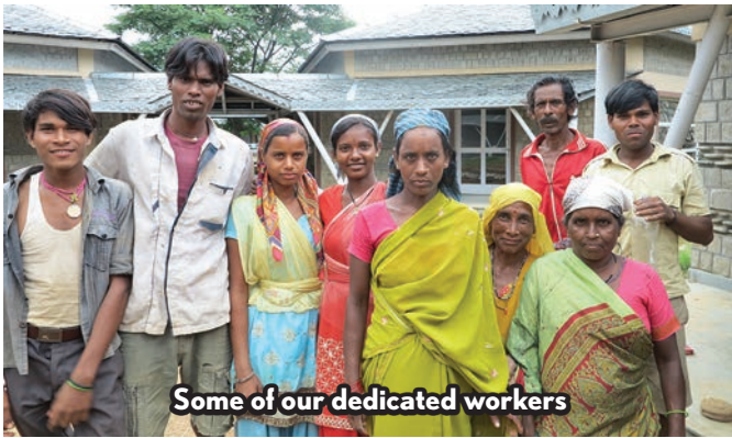
Some of our dedicated workers

“The DGL Nunnery is looking so beautiful. The workers worked very hard to build.”