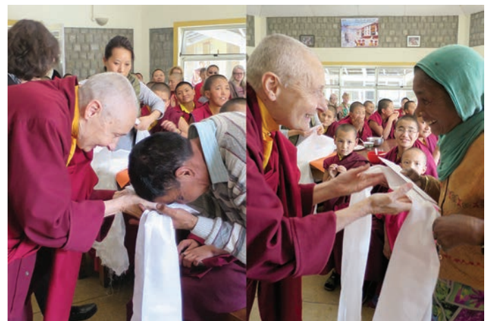
Thanking our workers for their dedicated work