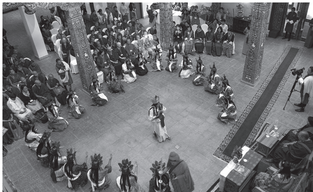
Opening Ceremony of the Conference

Some of the topics covered by the speakers included: The importance of education for nuns; nuns engagement with the local community; nuns as agents of positive, social change; how to live as a community. Health and well-being.