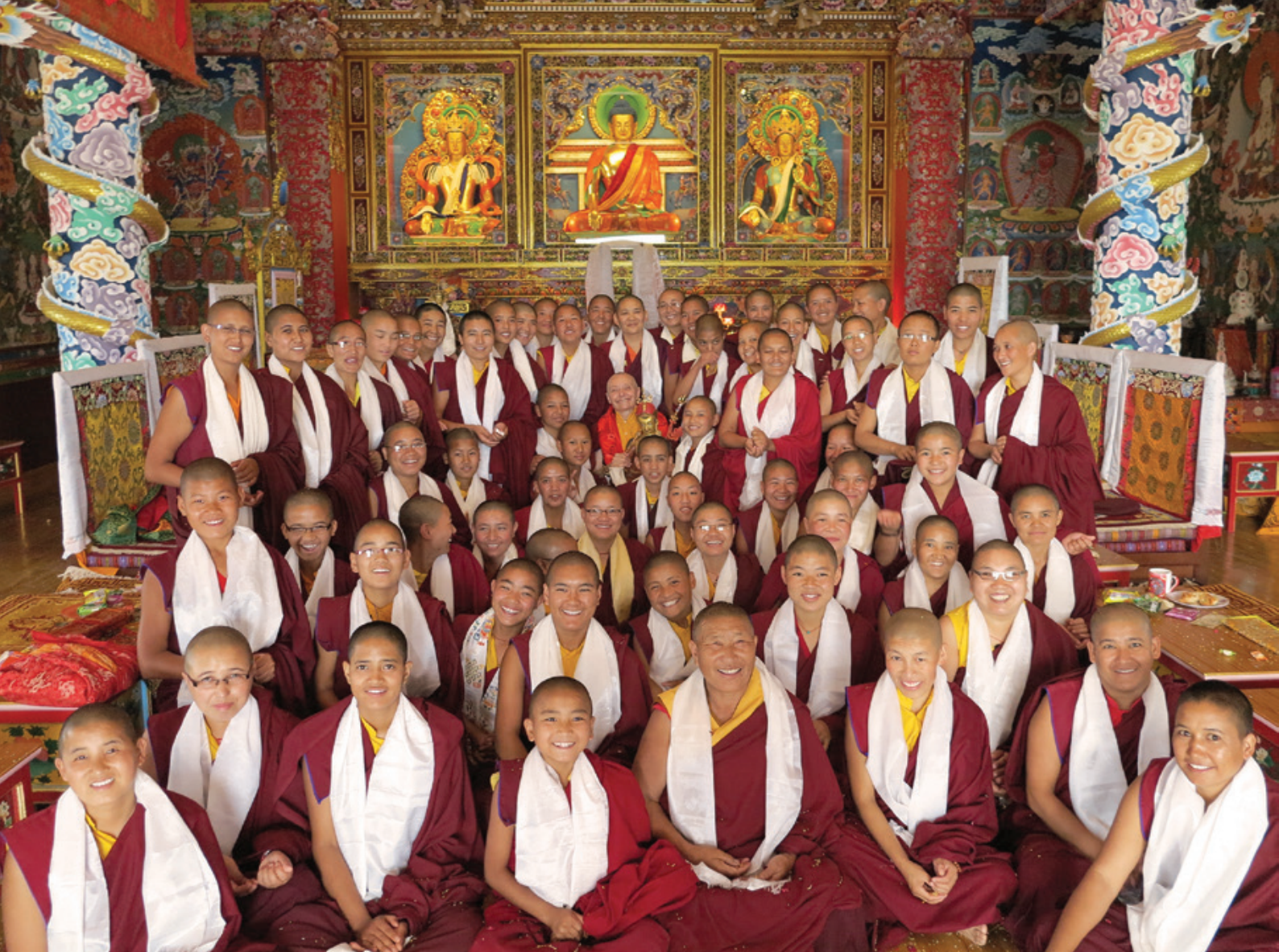
Front cover: H.E. Khamtrul Rinpoche at DGL Temple Consecration. Above: Jetsunma with nuns after Guru Rinpoche puja.