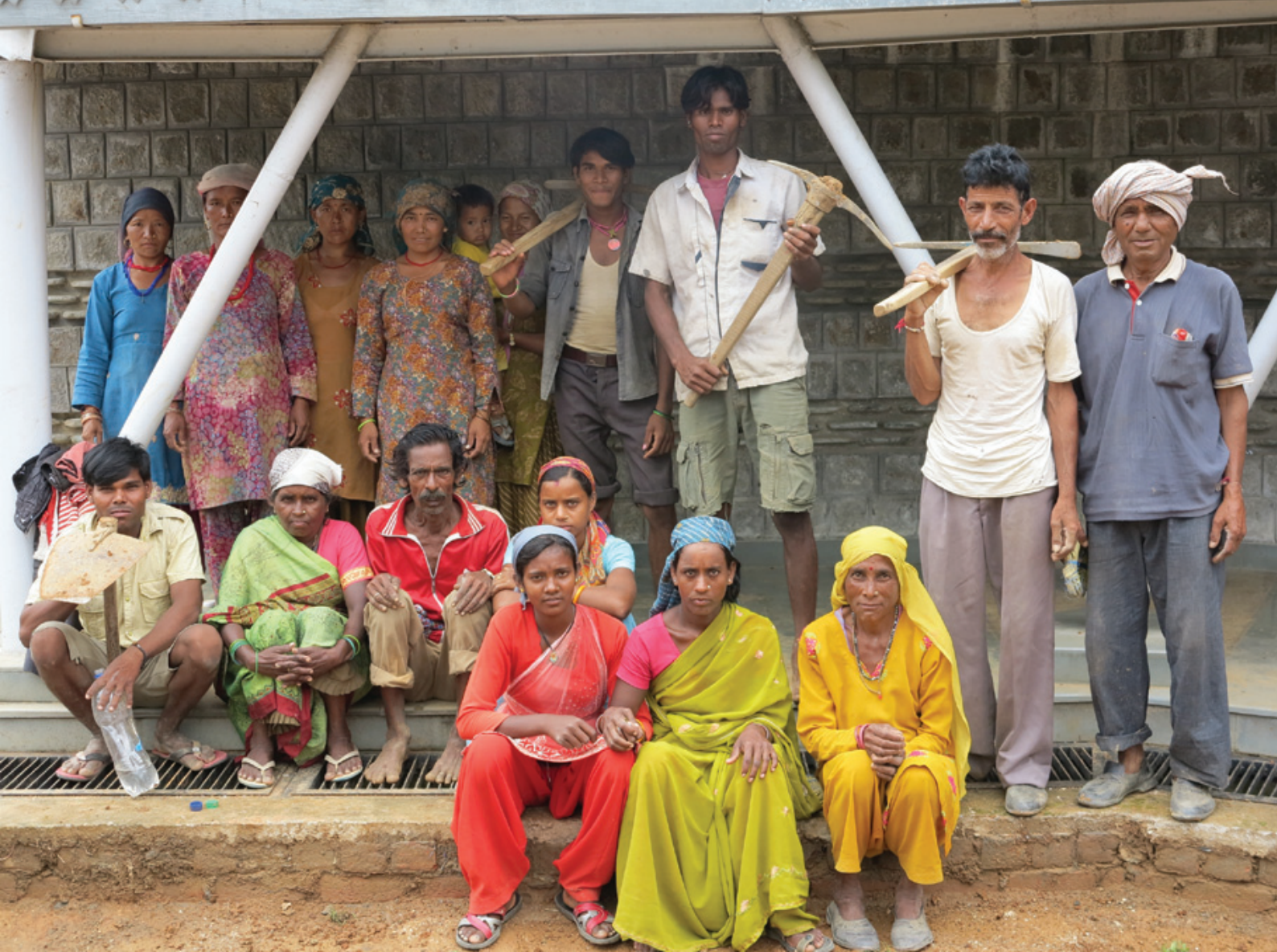
Work continues here with our loyal team of workers busy paving the courtyard around our nunnery