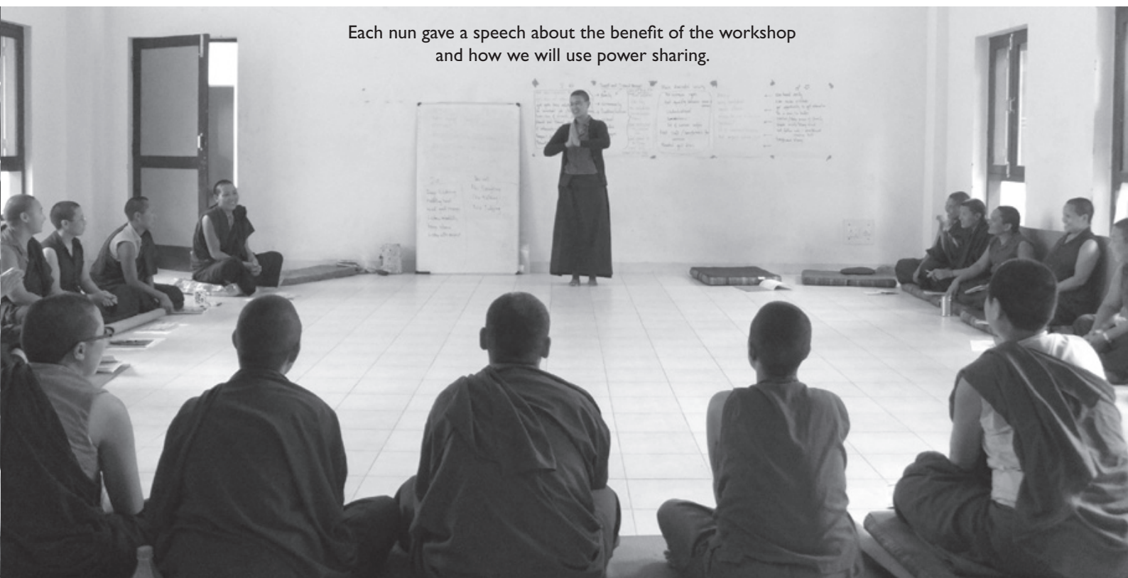
Each nun gave a speech about the benefit of the workshop and how we will use power sharing.

This article is a compilation of many of the nuns feedback from the workshop.